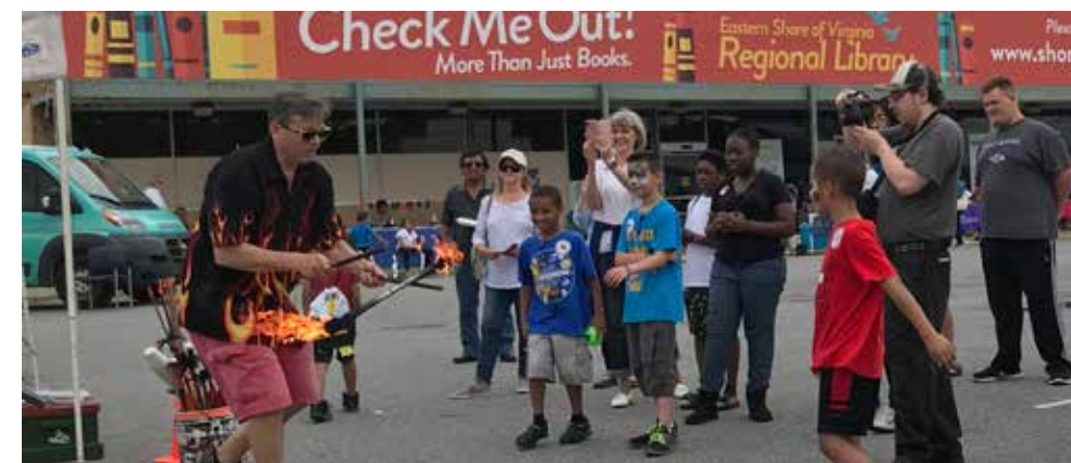
2017 grant recipient Eastern Shore Public Library "Celebrate Us" festival at the new location in Parksley. Groundbreaking to take place in 2019!

Detailed Financial Statements Are Available Upon Request