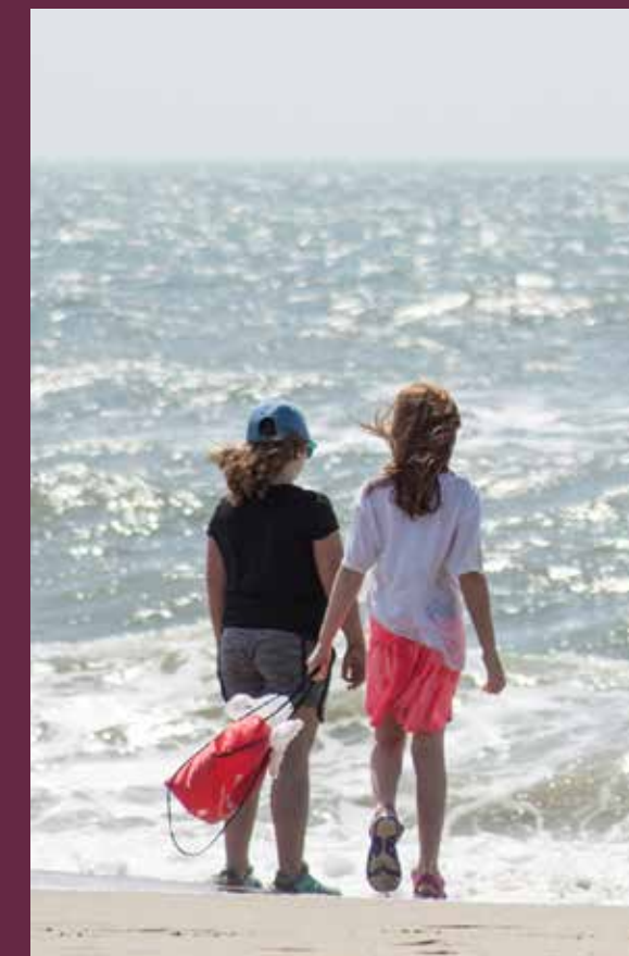
Chincoteague Bay Field Station students beach combing at Wallops Island.

Eastern Shore Community Foundation Family of Funds was valued at $10,608,665 as of December 31, 2018.