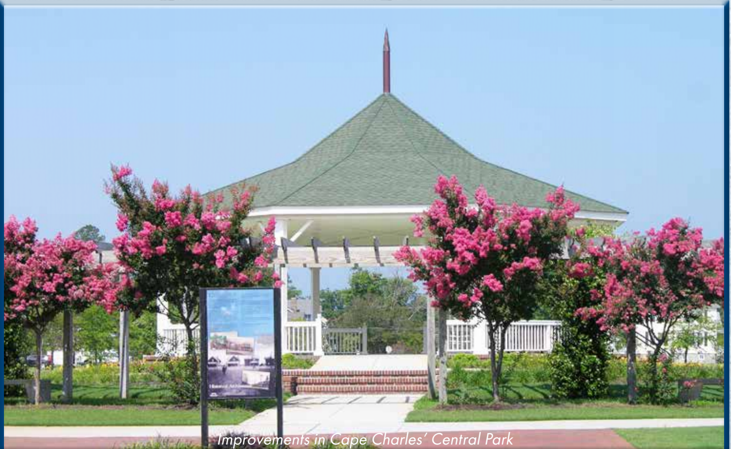
Improvements in Cape Charles' Central Park