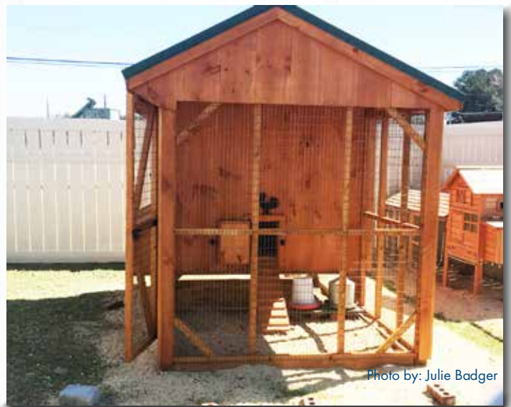
Newly constructed chicken coop is a project of No Limits Eastern Shore in Tasley.

Chesapeake Bay Foundation (2016) - $25,000