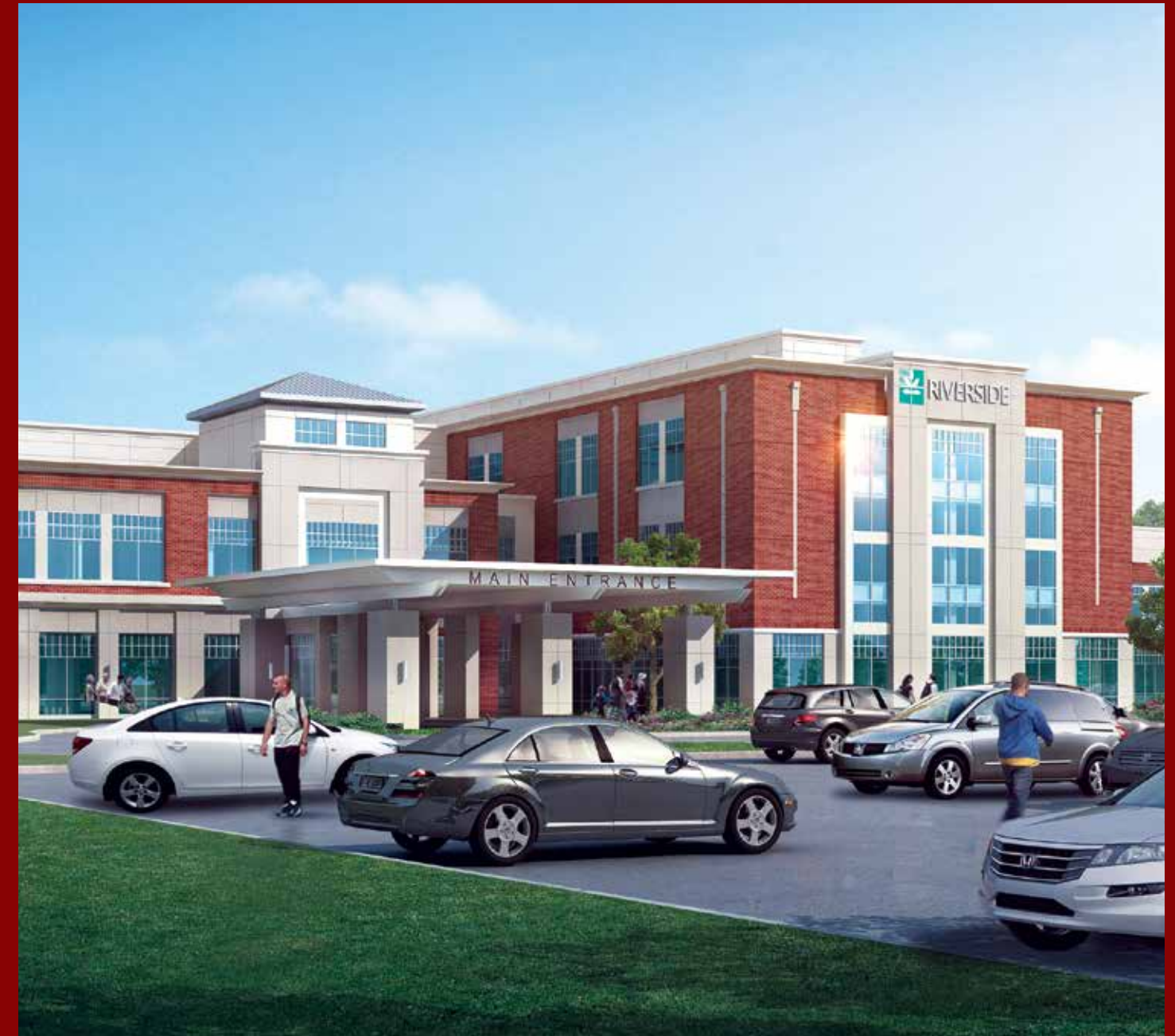
Main entrance of the new Riverside Shore Memorial Hospital in Onley, Virginia. The Auxiliary of Shore Memorial Hospital is an ESVCF Partner.