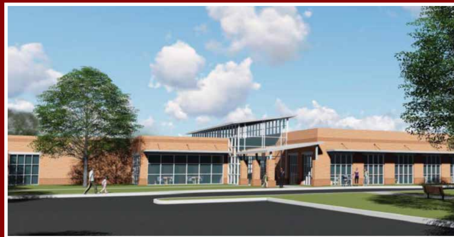
Conceptual design of the new Eastern Shore Public Library in Parksley, Virginia. ESVCF Grant Recipient No. 52, 2016.

The Eastern Shore of Virginia Community Foundation is guided by certain values and principles.