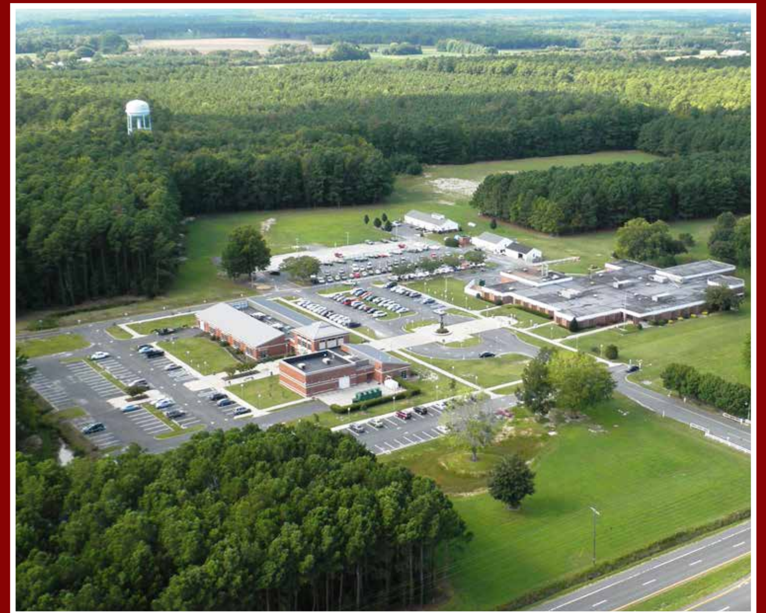
Aerial view of Eastern Shore Community College Campus in Melfa, Virginia. ESVCF Grant Recipient No. 11, 2010 and Argyle Fund recipient.

Making critical grants to meet current and emerging community needs and opportunities.