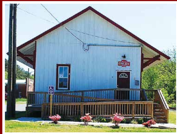
Society for Preservation of Onley Train Station. ESVCF Grant Recipient No. 43.

To help with the replacement of the main roof on the Island Theatre on Chincoteague. (10/22/2012)