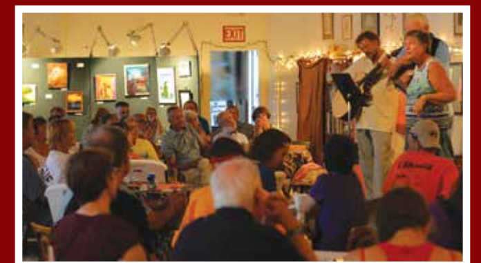
CCA's Coffeehouse event, Chincoteague. ESVCF Grant Recipient No. 56, 2016.

Barrier Islands Center - $34,200: For help with repairs to the porch of the Barrier Islands Center. (10/27/2014)